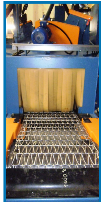
RB-600 AH 4

Dust emission after the filter is not more than 3\text{mg}/\text{m}^3 .